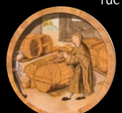
12 - Rue Tiquetonne (corner of rue des Balances): fresco of the coopers (spring 2016).