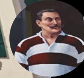
13 - Rue Noël-Sylvestre : The rugbymen of Béziers (summer 2018). Follow Avenue Georges-Clémenceau, then Avenue Jean-Moulin, until you reach the media library.