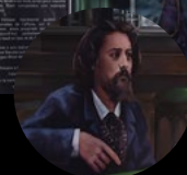
10 - Fresco on the forefront of Boüeldieu street : L'Arlésienne, by Alphonse Daudet, is in fact from Béziers ! (December 2015).