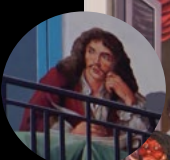
4 - 9, avenue Alphonse Mas: Molière performed his very first play 'Lover's resentment' in 1656... in Béziers (July 2016).