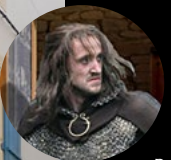
17- 15/17 rue de la Citadelle: Viscount of Béziers, Raimon Trencavel (April 2020).