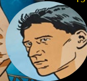
15 - 21, avenue Alphonse-Mas: Honoré d'Estienne d'Orves, aviator and resistance fighter executed in 1941 (fresco inaugurated on 8 May 2019).