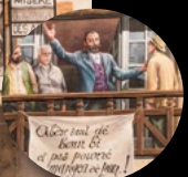
3 - 30, rue Saint Jacques: The winegrowers' revolt in 1907 (October 2016).