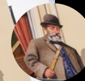
9 - Place Saint-Esprit : Camille Saint-Saëns and his opera «Déjanire», performed in the Béziers arena (April 2017).