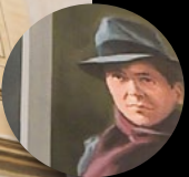
1- Place Lavabre: Jean Moulin, national hero of the French Resistance, and his passion for drawing and painting (December 2015).