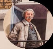
5 - Place des Bons Amis, at the entrance to Rue Viennet: the sculptor Jean-Antoine Injalbert (October 2016).