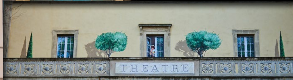
8 - Rear façade of the municipal theatre: a nod to «commedia dell'arte» (2017).