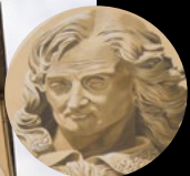
7 - 17, avenue du Colonel d'Ornano: The 9 locks of Fonseranes and their creator, Pierre-Paul Riquet (April 2017).