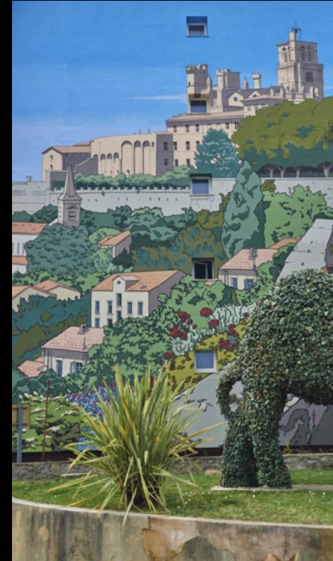
19 - Place des Provinces: «view on the cathedral» and its surroundings (February 2021).